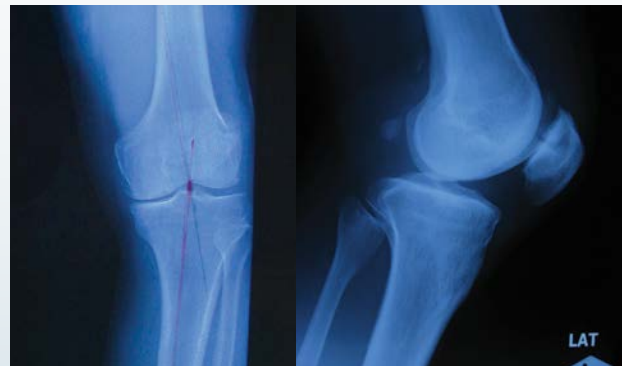
X-Ray Images of the Knee before Robotic Unicompartment Knee Replacement