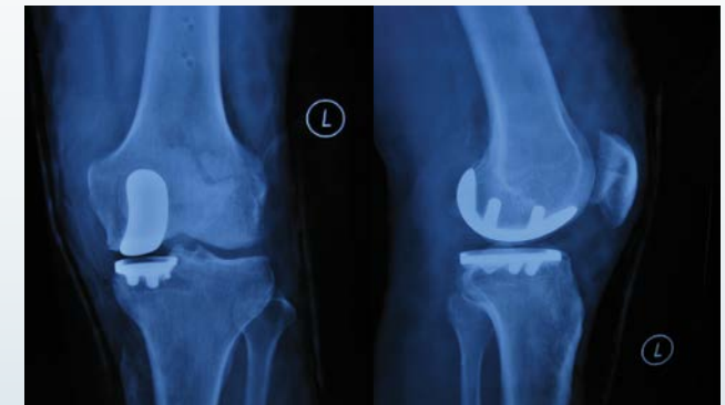
X-Ray Images of the Knee after Robotic Unicompartment Knee Replacement

With the RIO System, surgeons can replace just the patellofemoral joint, the medial or lateral femorotibial joint, or a combination of these joints.