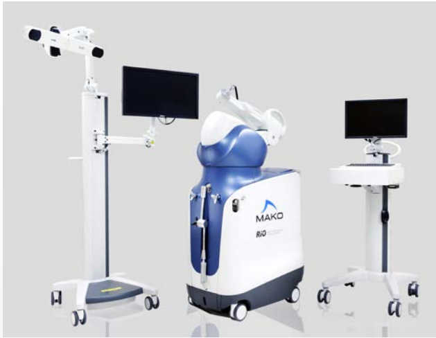
Robotic Interactive Orthopaedic System (Makoplasty)